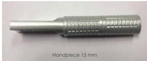
Handpiece 15 mm