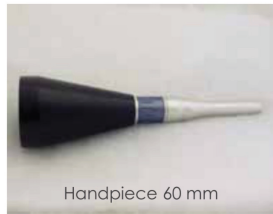
Handpiece 60 mm